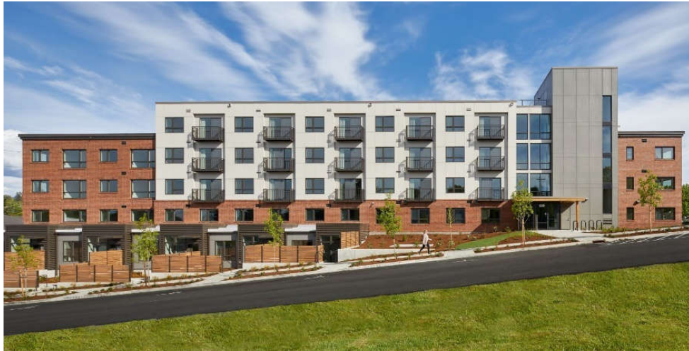
Phase 1 of the BHA Samish Way Redevelopment Project completed

Covering the Period from July 1, 2021 – June 30, 2022