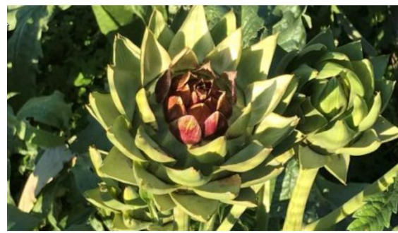
Sven Hoyt Community Garden Located on 32nd Street between Taylor Avenue and Donovan Avenue