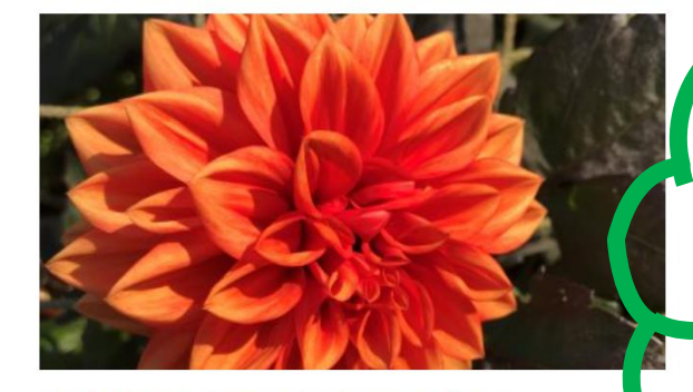
Lakeway Community Garden Located at Lakeway Drive and Woburn Street