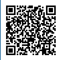
Scan QR code to join the Zoom meeting

1-888-788-0099 Meeting ID: 832 7345 5011 Passcode: 11486671