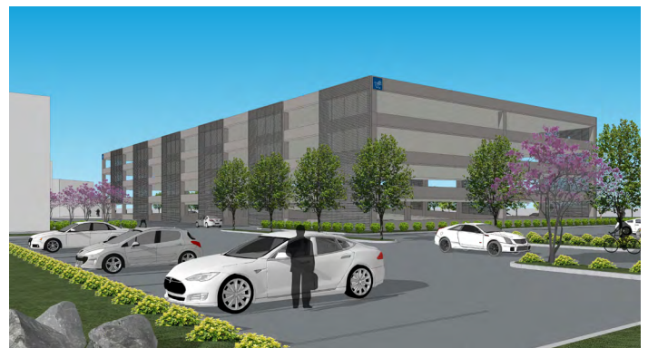
PeaceHealth St. Joseph Medical Center Parking Garage, conceptual rendering

Parking Garage Construction Estimated Completion