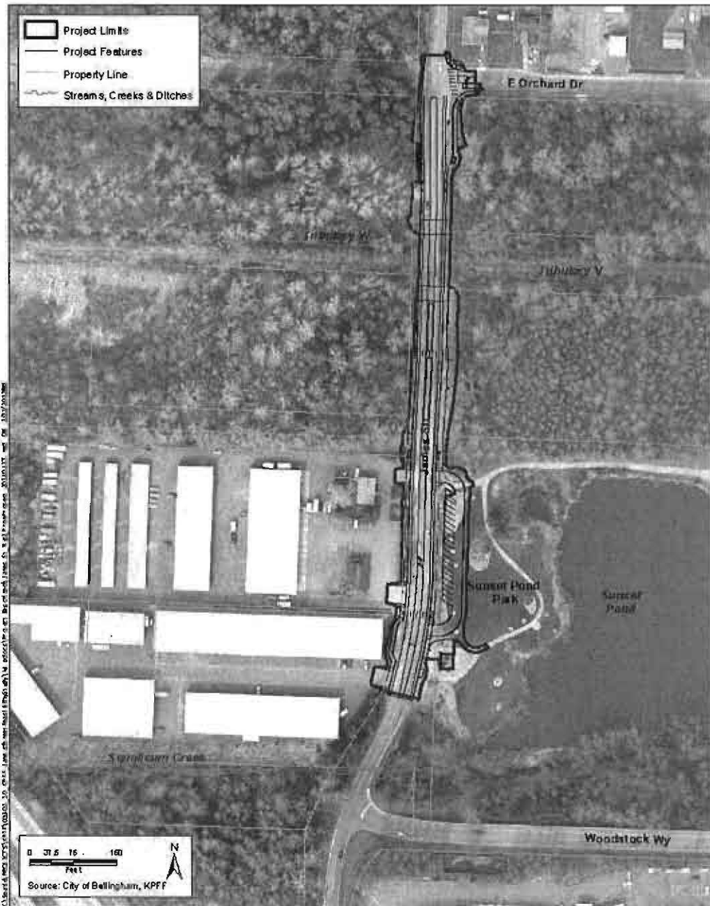
Figure 2 Proposed Project James Street Road Bridge Replacement and Road Improvement Project