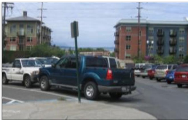
Photo 3.2 Parking Improvements on McKenzie Avenue between 11 th and 12 th Streets.