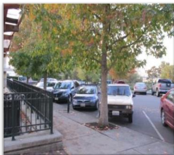
Photo 3.1 Parking along Mill Avenue.

Currently the parking in Fairhaven works adequately although there are increasing reports of employees and/or residents occupying on-street spaces long-term, limiting access to on-street parking for customers. Though frequently discussed, time-limited parking is not currently an option. Monitoring time-limited parking is highly staff intensive and generates correspondingly high staff costs but no revenue to cover the expenditure of resources. Current parking