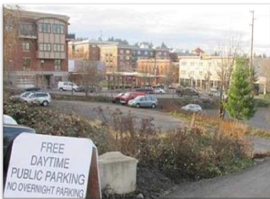
Photo 3.3 The 'Pit' parking lot at 11 th and Mill